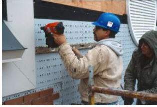
Mechanically Fasten Backer Panel