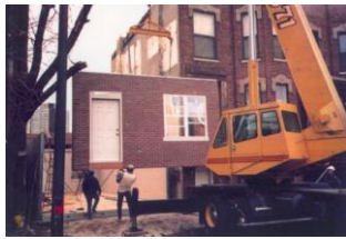
Can Be Done Off Site