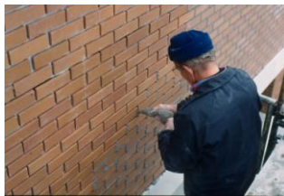
Tuck Point Mortar Joints