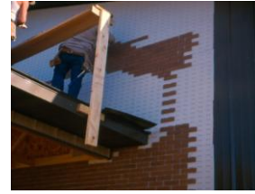
Install THIN BRICKS onto wall