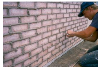
Strike and Clean