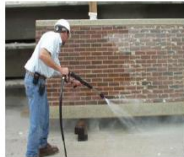
Strip and Clean