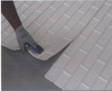
Lay out LINER