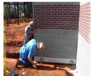
Install at Final Position