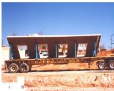
Transport to Jobsite