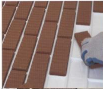
Insert THIN BRICKS