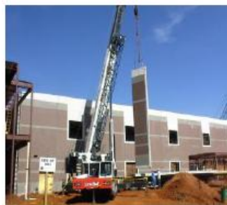
Pick and Place